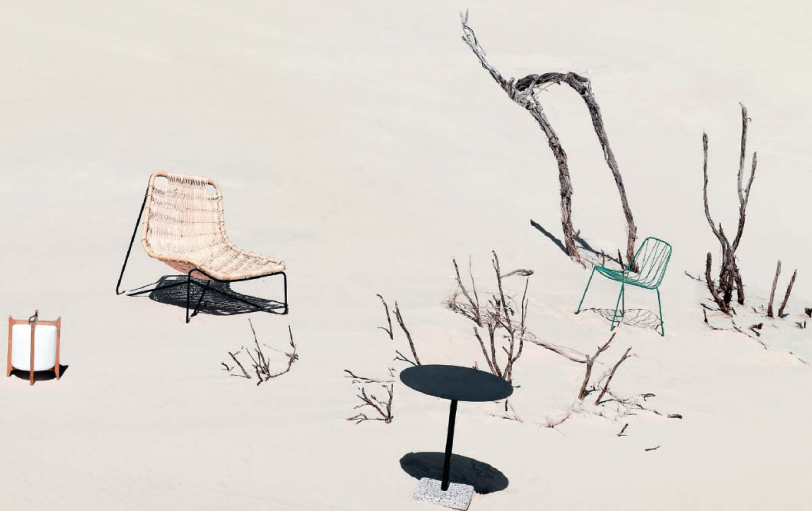
Clockwise from left: Gloster 'Voyager' lantern, $669, from Cosh Living. Expormim 'Tina' armchair, $4033.70, from Ke-Zu. SP01 'Jeanette' chair, POA, from Space. Hay 'Terrazzo' table, $724, from Cult.

COASTING ALONG WITH OUTDOOR PIECES IN NATURAL MATERIALS AND SLIM LINES THAT INVITE RELAXATION.